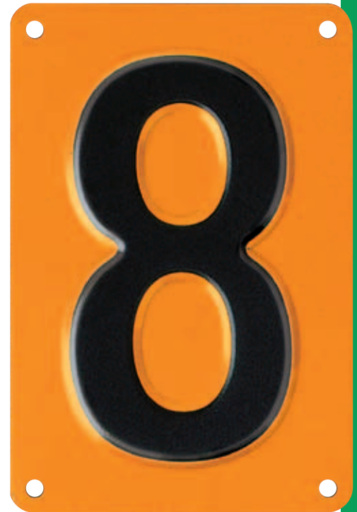
3 inch Universal Tag on Orange Background