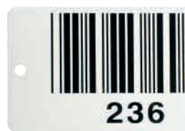
Bar Coding on anodized aluminum.