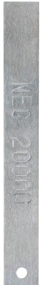
Stamped Aluminum Meter Tag

Our meter tags are also available in anodized aluminum (with or without adhesive backing and barcodes) and pressure sensitive vinyl in a wide variety of colors and sizes. Color, size and text are all customized to your specifications.