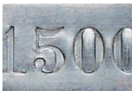
Stamping: Character is depressed into the surface.

*All Meter Tags are custom ordered. Please call our factory at 1-800-328-0194 for more information. Meter Tags are not returnable.