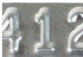
Embossing: Character is raised from the surface.