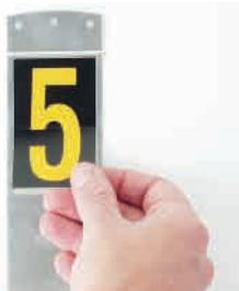
Easy to align and attach.

*See how to order on back side of this sheet