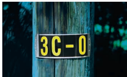
Durable aluminum won't split or crack.