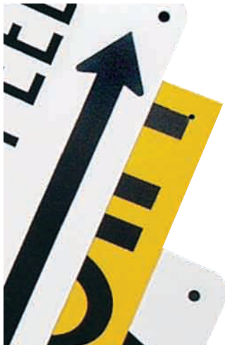
Custom signs designed with your marking needs in mind.

See additional information on back side of this sheet