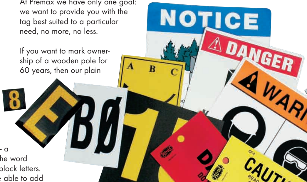
Assorted Custom Vinyl & Self-Sealing Tags

If you want to mark ownership of a wooden pole for 60 years, then our plain