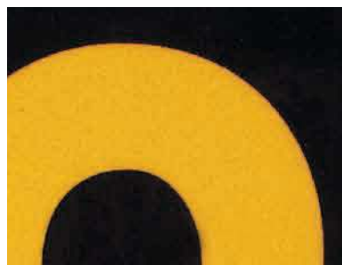
Engineering Grade Reflective Vinyl.