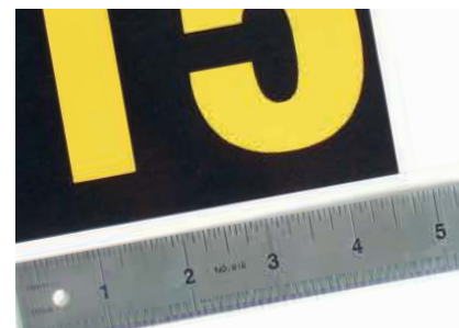
Custom sizes available.