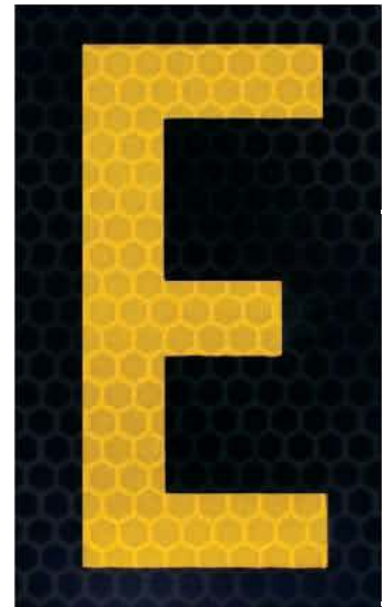
2-1/4 inch High Intensity Grade Marker

Available in Engineer Grade and High Intensity Grade reflective sheeting. Other colors and sizes available: consult factory.