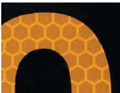
High Intensity Grade Reflective Vinyl.

*See how to order on back side of this sheet