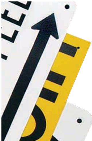
Custom signs designed with your marking needs in mind.

See additional information on back side of this sheet