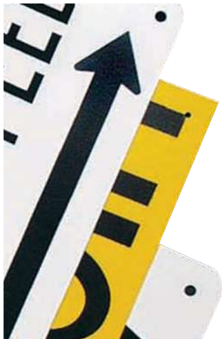
Custom signs designed with your marking needs in mind.

See additional information on back side of this sheet