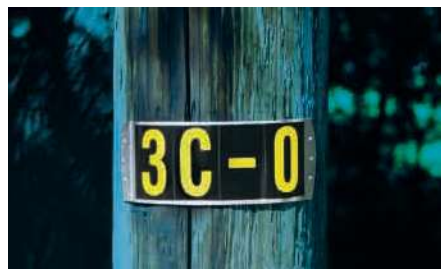
Durable aluminum won't split or crack.