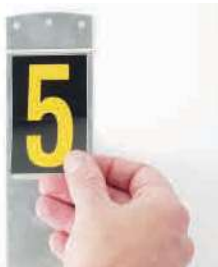
Easy to align and attach.

*See how to order on back side of this sheet