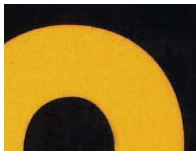
Engineering Grade Reflective Vinyl.