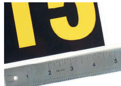
Custom sizes available.