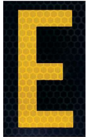
2-1/4 inch High Intensity Grade Marker

Available in Engineer Grade and High Intensity Grade reflective sheeting. Other colors and sizes available: consult factory.